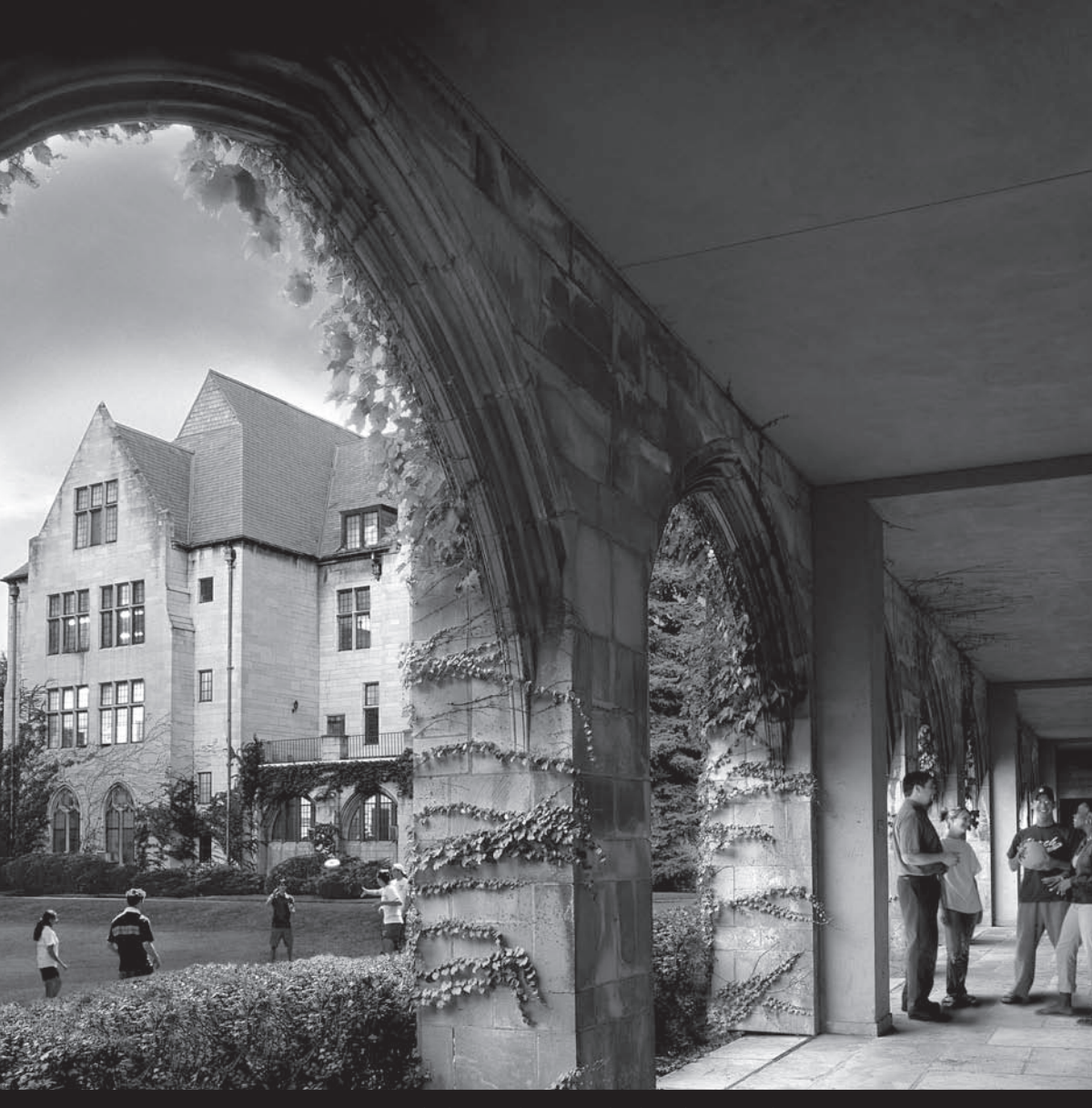
Dominican University, A Catholic Coeducational Liberal Arts and Sciences University Rosary College of Arts and Sciences